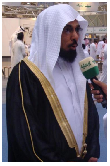
( Salman al-Awda

In August 2018, religious cleric Salman al-Awda was brought to trial before the SCC in a secret session, where he was accused of 37 charges, some under the counter-terror law, for financially supporting a pan-Gulf youth forum; his alleged affiliation with the Muslim Brotherhood; his participation in a petition calling for, amongst other things: an elected Shura Council, separation of the executive and legislative branches of government, reform of the judicial system, the establishment of civil society organizations and freedom of expression. He was also accused of supporting calls for government reforms and regime change in the Arab region. During his first trial session in August 2018, the public prosecution demanded his execution based on the above charges.